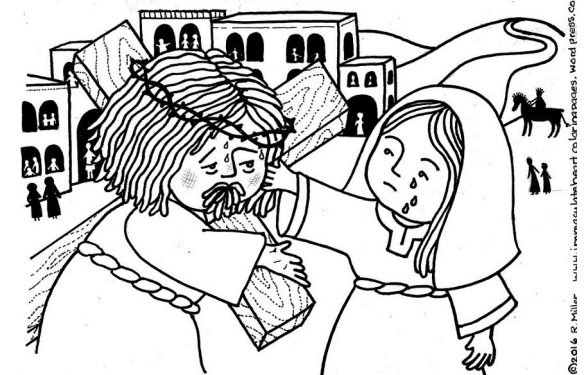
Jesus Meets His Sorrowful Mother

O Mary, Mother of the Life Within, all life we entrust to you; The life of every expectant mother and the child within her womb: The life of every human body, the life of every human soul; The life of every newborn child and the life of all grown old. You held the Lord to your own heart and drew Him so close in. So draw us now in all our needs, O Mother of the Life Within. Amen.